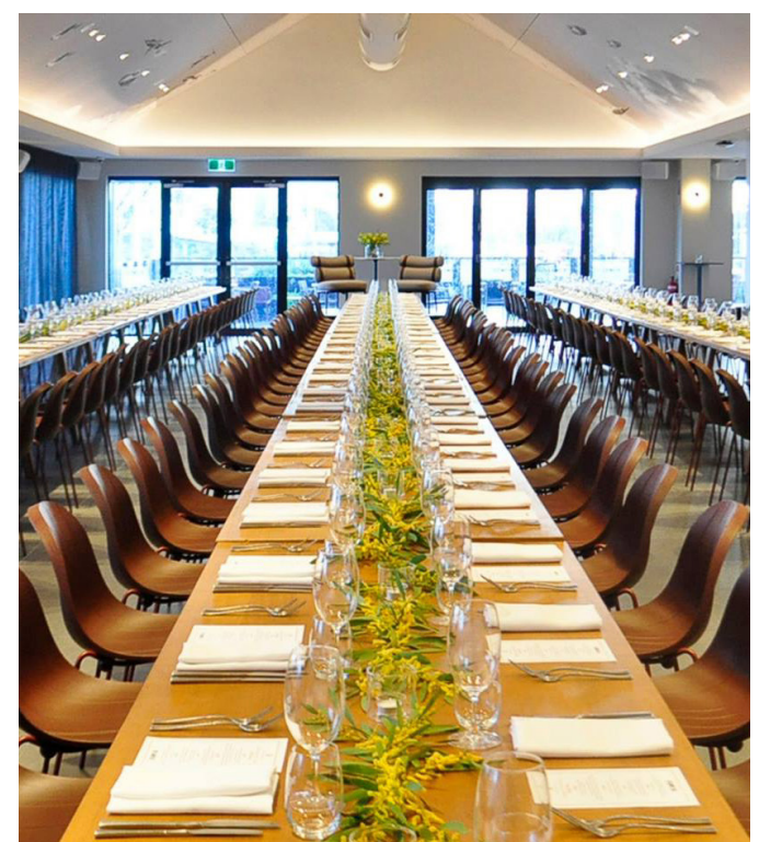
All of the Camfield's function spaces feature EVID-S loudspeakers. The spaces can be used for a variety of functions that require speech, video and music audio distribution. Intelligibility was therefore an important consideration when choosing indoor speakers.

ease of installation. Backed with The Camfield being so close to the Swan River, speakers that could perform in an environment such as this were integral to deliver the project. Since the opening of the venue the support for the product from an integrator's perspective has been outstanding and we look forward to working with Electro-Voice and Audio Source (Distributors of Electro-Voice in WA) again on upcoming projects. The performance of both the indoor and outdoor speakers selected outdoes what was proposed to the client, exceeding their expectations and delivering a higher quality of sound than previously thought with acoustic challenges throughout the venue including stadium ambience."